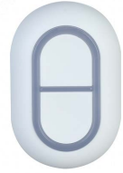
Wireless Panic Button